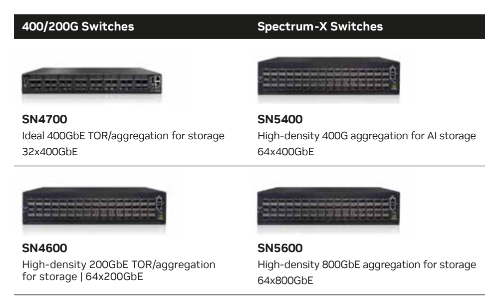
Figure 3. Spectrum ESF switches for Al. Spectrum-X is only compatible with SN5400 and SN5600.